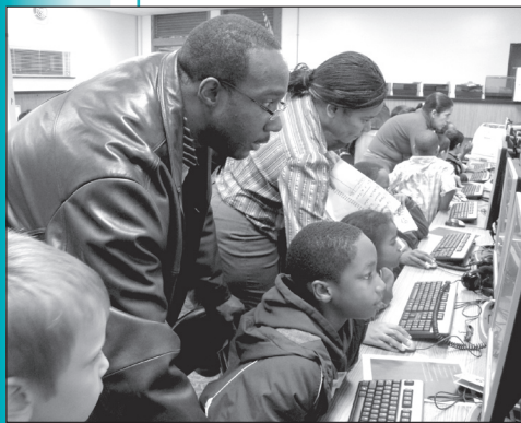
PHOTOS: DURING MATH NIGHT, FAMILIES PARTICIPATED IN EVENTS THAT WERE BOTH EDUCATIONAL AND FUN.