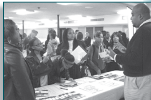
STUDENTS AND PARENTS OBTAIN INFORMATION FROM A HIGH SCHOOL REPRESENTATIVE.

This year also marks the first time that families of seventh grade students were invited to attend. In organizing the event, school administrators recognized the need for early awareness and planning prior to deciding on a high school. The program has become a tremendous benefit to meeting the needs of students and their families.