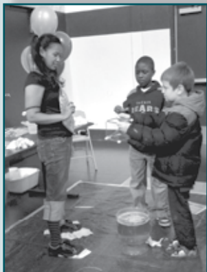
SOAP BUBBLES DEMONSTRATE A MATH THEORY.

bubbles and learned that bubbles behave according to mathematical rules. Bubble film will always try to make the smallest possible surface. Bubbles are a real-world example of what mathematicians call a minimal surface. There is a whole field of mathematics called Minimal Surface Theory that deals with the types of shapes that bubbles form!